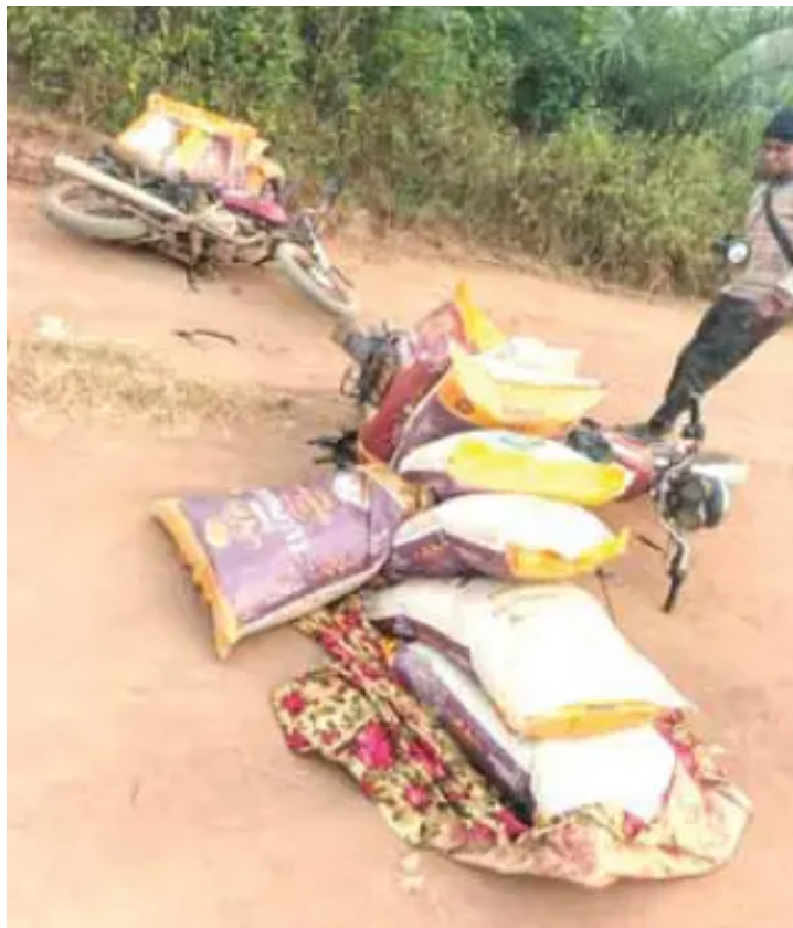
The seized items