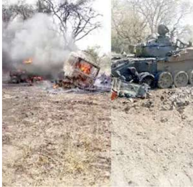
Armored vehicles burning in the bush after the convoy attack in Timbuktu triangle in Borno State yesterday

By Hamisu Kabir Matazu (Maiduguri) & Idowu Isamotu (Abuja)