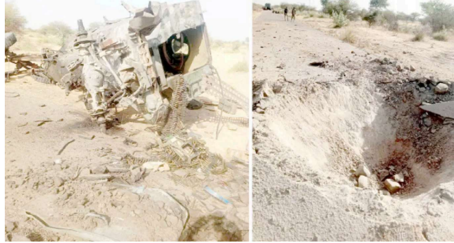
Armoured vehicles destroyed by explosives suspected to be Improvised Explosive Devices (IEDs) planted by Boko Haram along the Gubio axis of Borno State yesterday