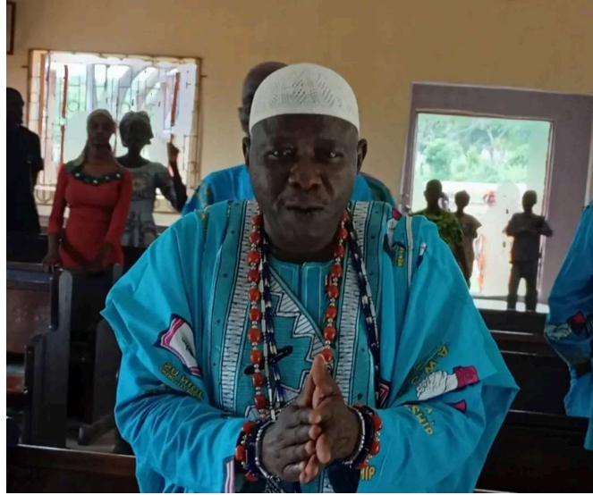
The kidnapped monarch