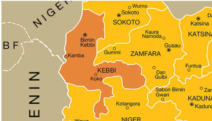
Kebbi State Map