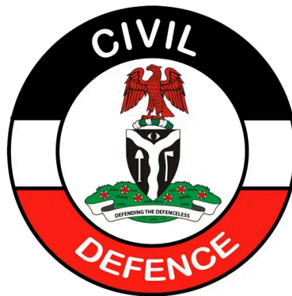
Nigeria Security and Civil Defence Corps (NSCDC)