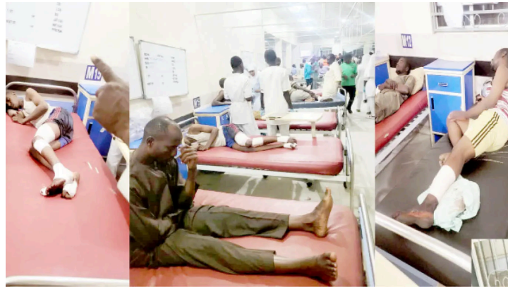
Some of the survivors of the bomb blast receiving treatment at the Specialist hospital, Maiduguri yesterday