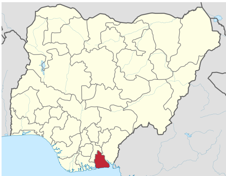
Akwa Ibom map