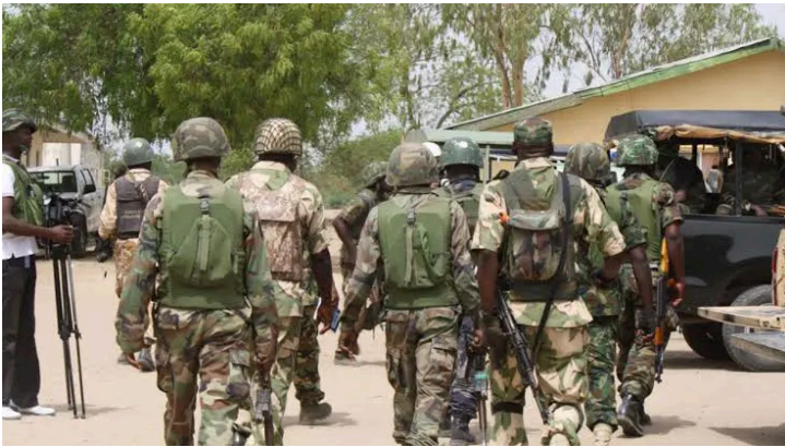
FILE PHOTO. Nigerian soldiers