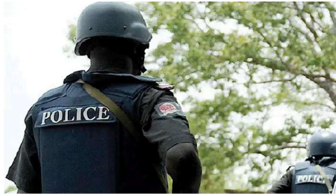
A Nigerian Police Officer