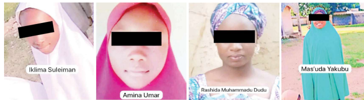
Some of the abducted students