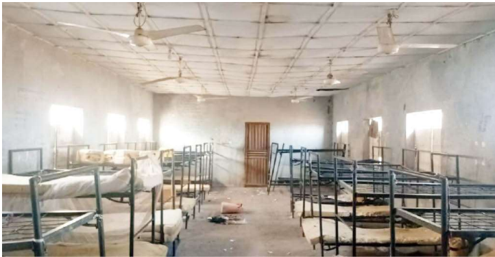
Inside one of the hostels where the bandits abducted the girls

The Senate also advocated increased deployment of modern surveillance and intelligence technology to combat insecurity and assist in locating the abducted Kebbi schoolgirls.