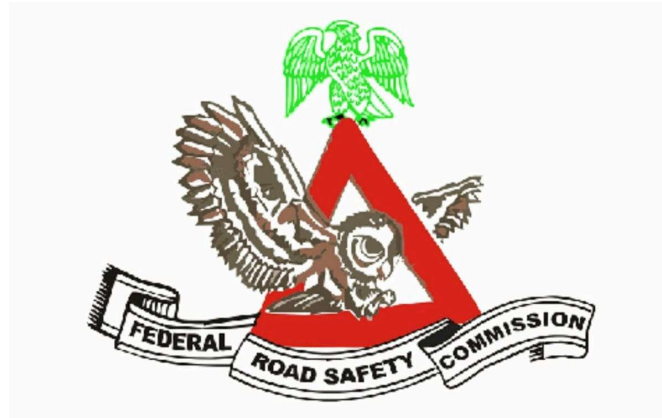
Federal Road Safety Commission