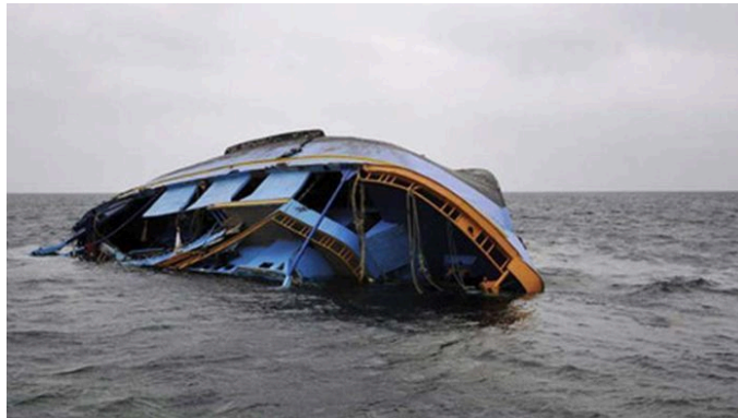
File Photo: Boat mishap