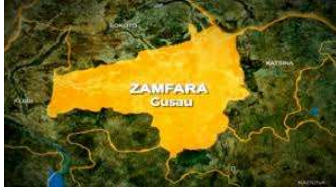
Zamfara state map